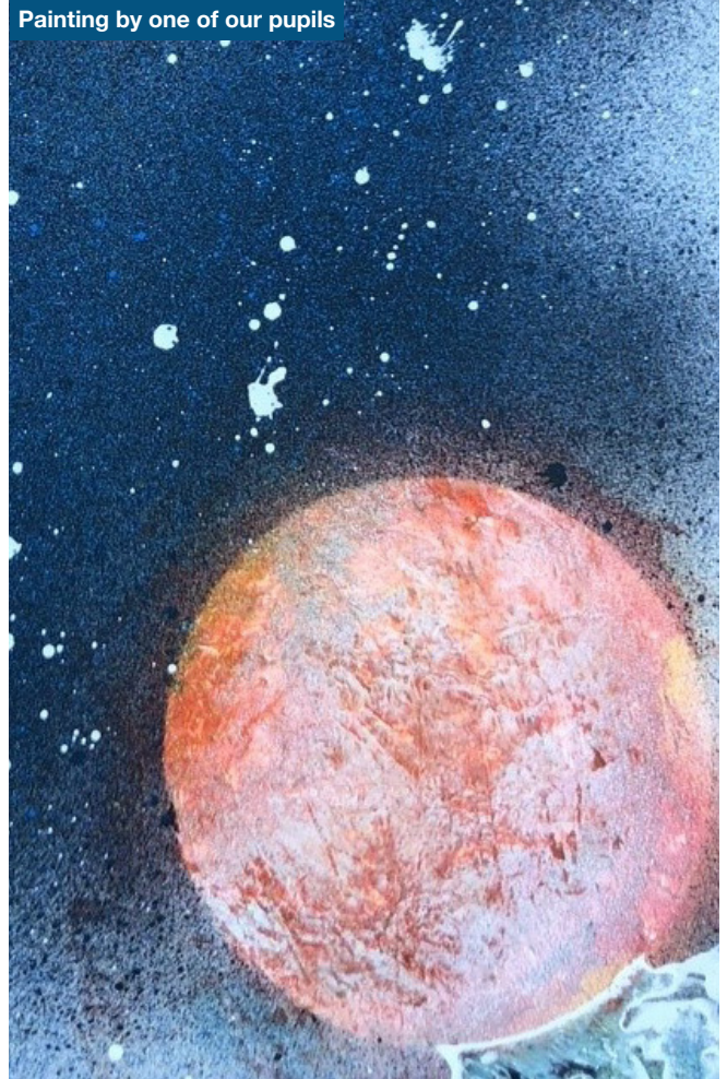
Painting by one of our pupils

Further information can be provided by the school concerning the arrangement for supporting pupils with English as their second language. All information, if requested, can be made available prior to any meeting. Our aim is to identify and support every special need identified or diagnosed. Every child will be offered a weekly therapy session and educational resources will be tailored to meet the needs of the pupils. All pupils will work on an individualised timetable designed to meet their specific needs.