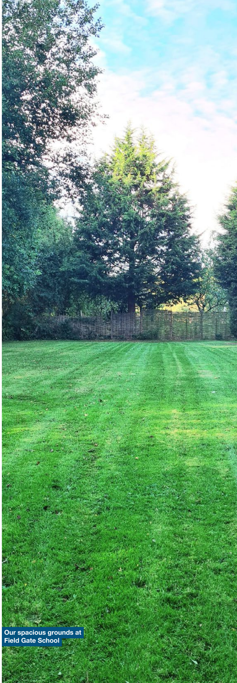
Our spacious grounds at Field Gate School