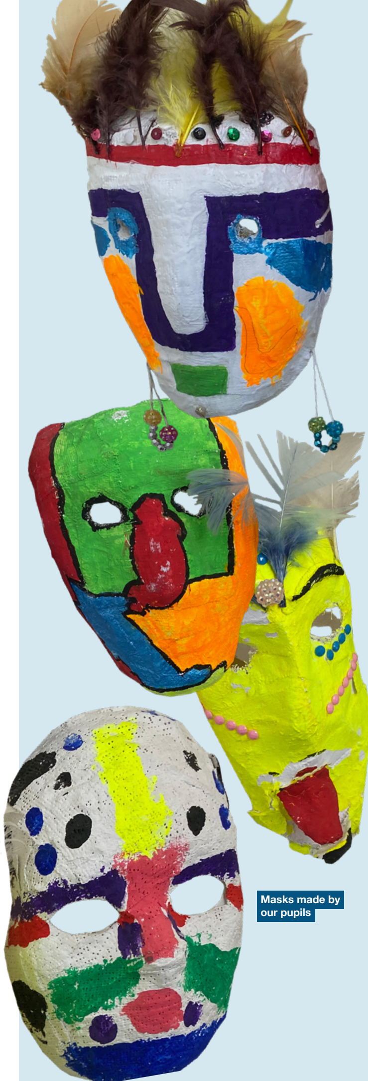
Masks made by our pupils