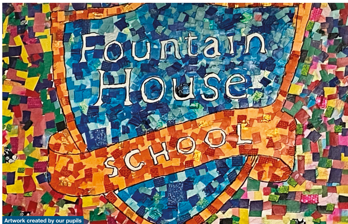
Artwork created by our pupils

"I love Fountain House School, more than any other school I've been to. I feel safe, welcome and my opinions are always listened to." Statement by a young person, via Southern Authority