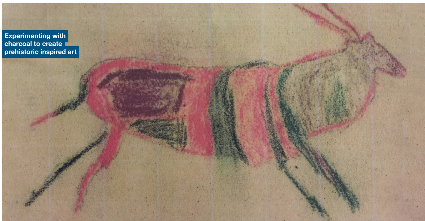
Experimenting with charcoal to create prehistoric inspired art

Each term we also hold a citizenship day where different aspects of citizenship are explored through various workshops, lectures and group activities as appropriate to the needs of the pupils, and to promote a greater understanding of their place in modern society.