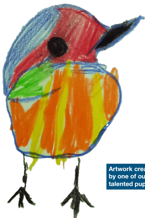
Artwork created by one of our talented pupils

As well as delivering a broad and balanced curriculum, we also pay special attention to the spiritual, moral, social and cultural development of the individual.