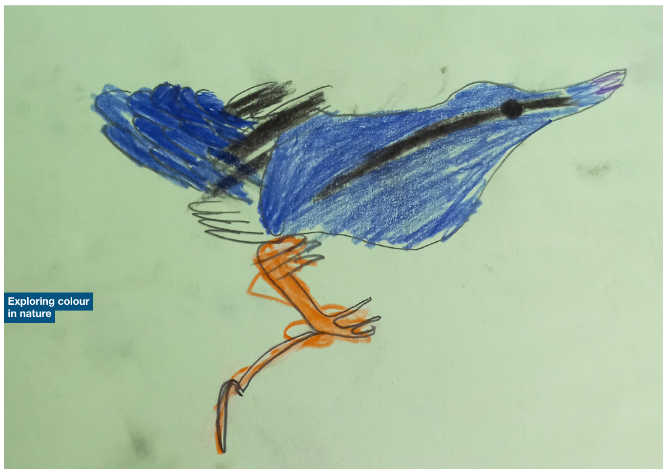
Exploring colour in nature

The behaviour policies at Clannad School are implemented by both care and education staff in cooperation and are done in a consistent and fair manner. At the beginning of a placement, the expectations of student behaviour are explained clearly and thoroughly. Guidelines and standards for reasonable dress in school are explained to the student and are displayed on the classroom wall.