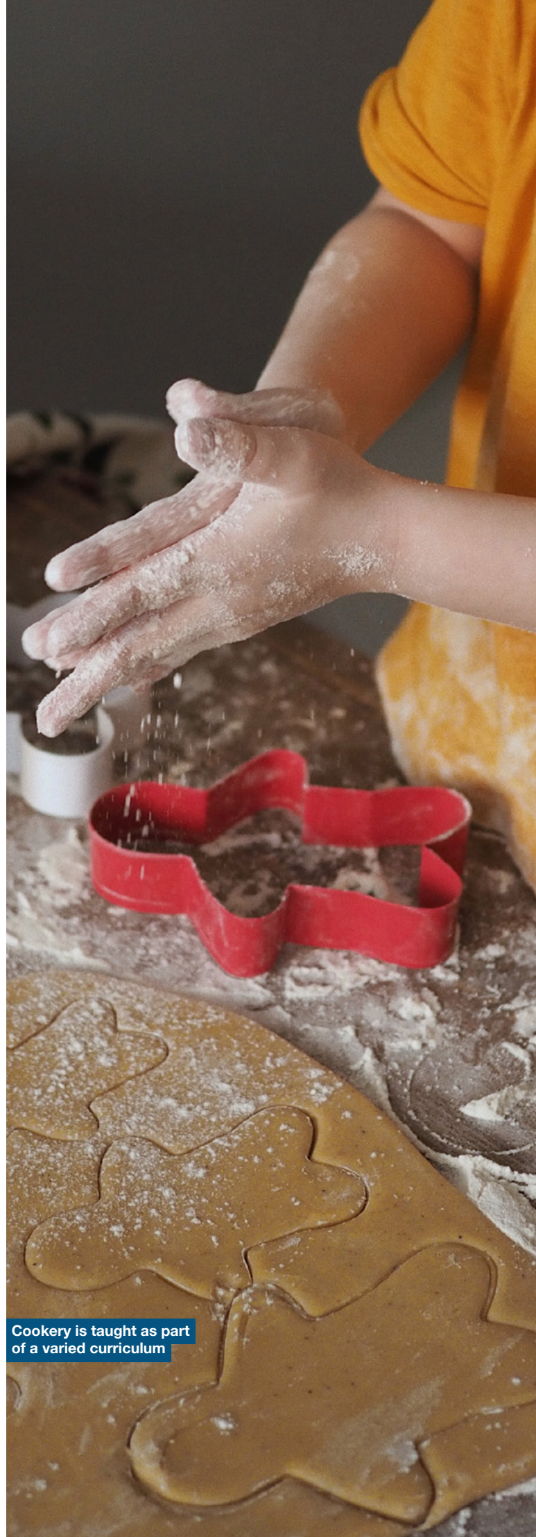
Cookery is taught as part of a varied curriculum