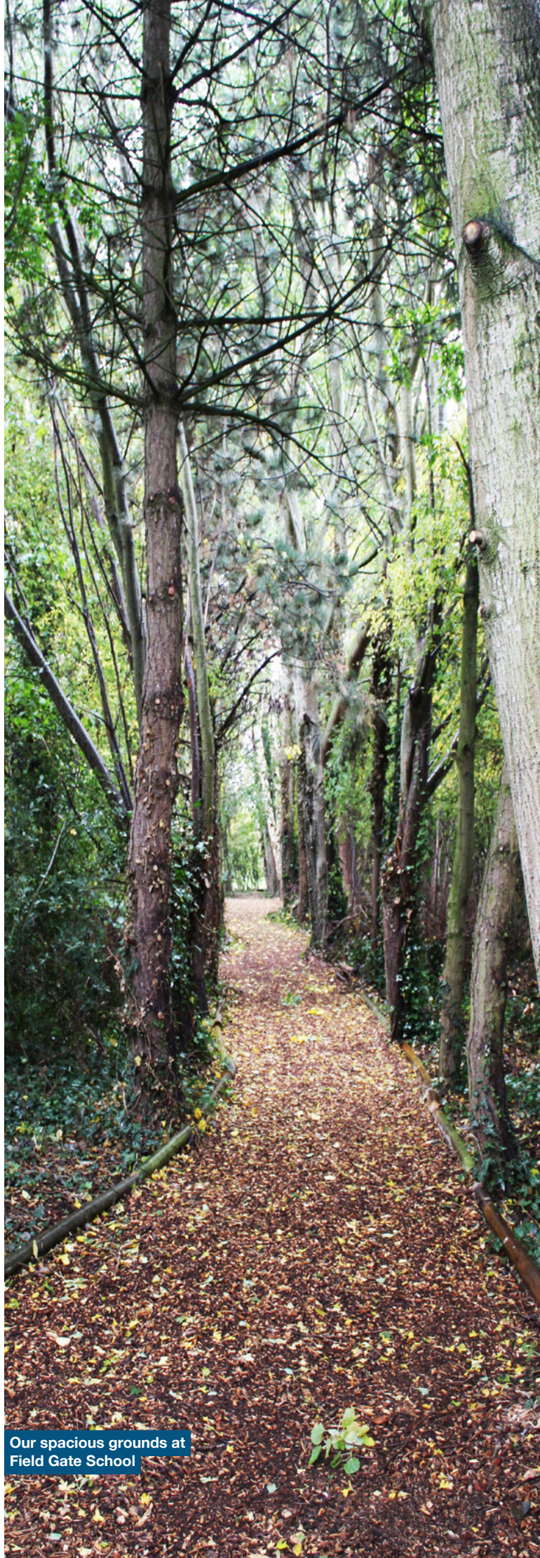
Our spacious grounds at Field Gate School