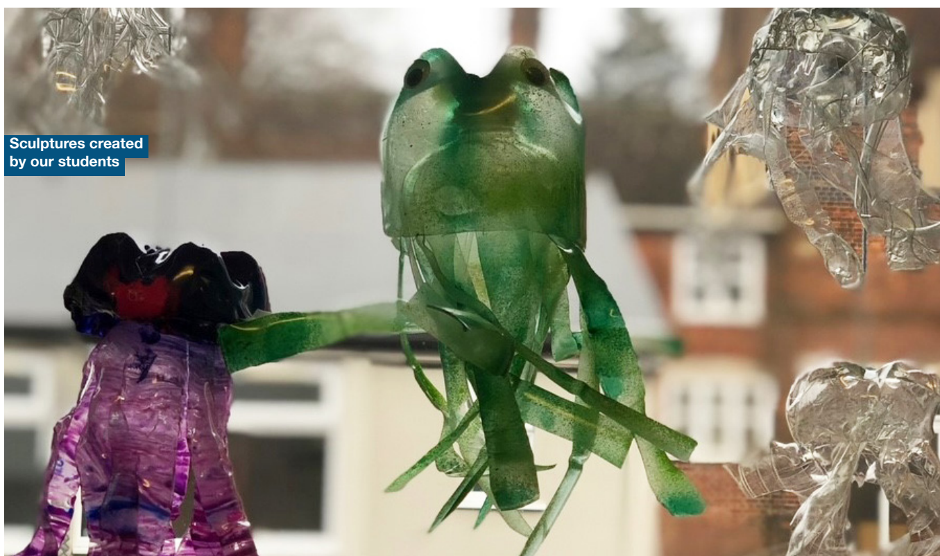
Sculptures created by our students