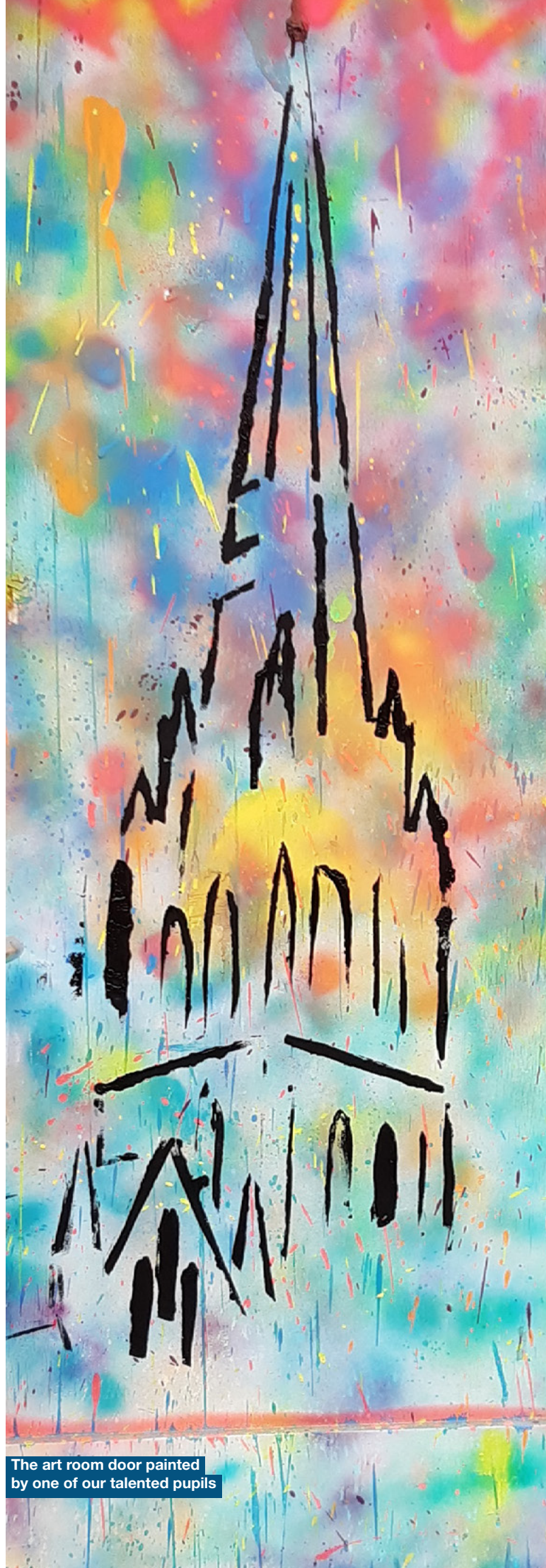
The art room door painted by one of our talented pupils