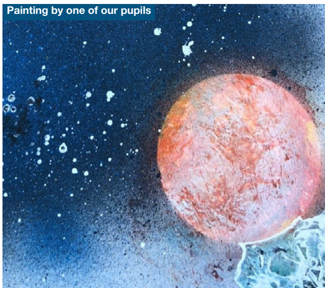
Painting by one of our pupils