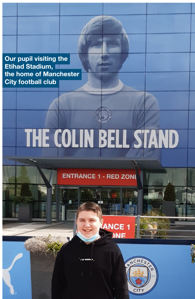
Our pupil visiting the Etihad Stadium, the home of Manchester City football club

Further information can be provided by the school concerning the arrangement for supporting pupils with English as their second language. All information, if requested, can be made available prior to any meeting. Our aim is to identify and support every special need identified or diagnosed. Every child will be offered a weekly therapy session and educational resources will be tailored to meet the needs of the pupils. All pupils will work on an individualised timetable designed to meet their specific needs.